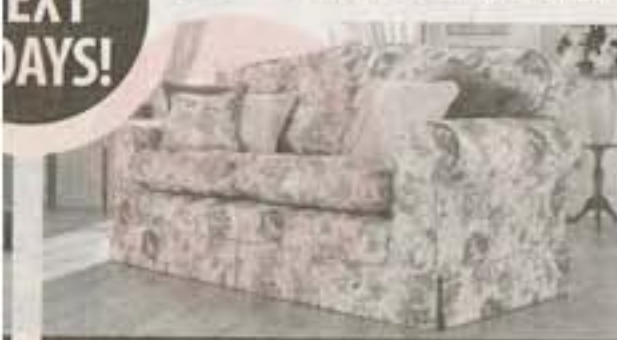
Rose & Scroll - Soft Peach, Classic make-up