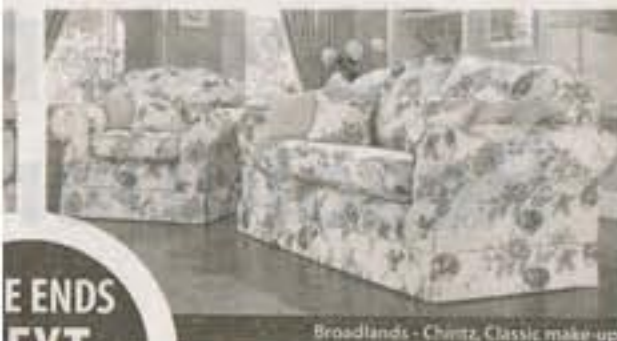
Broadlands - Chert, Classic make-up