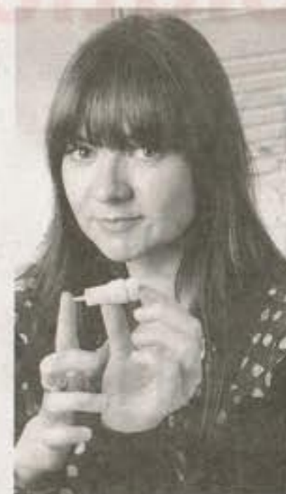
ANALYSIS: From Simplicity Health